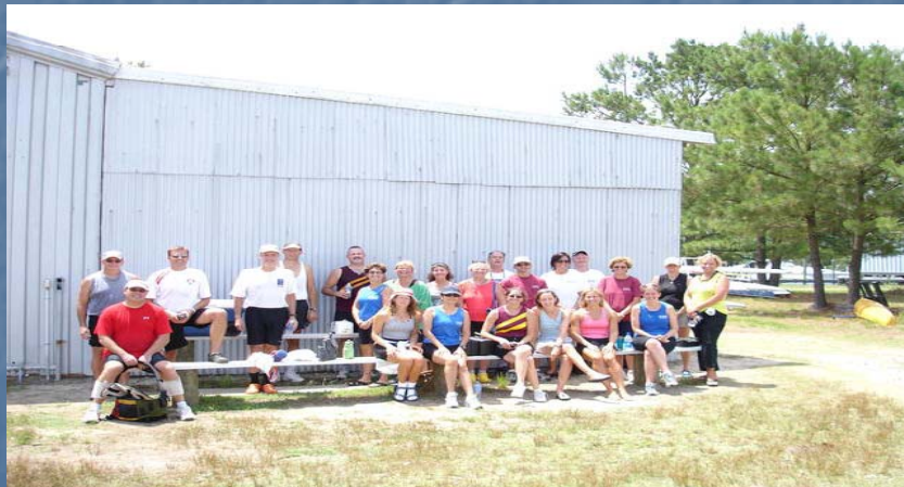
Juniper Rowing Club-Masters (JRC) Est. in 2002