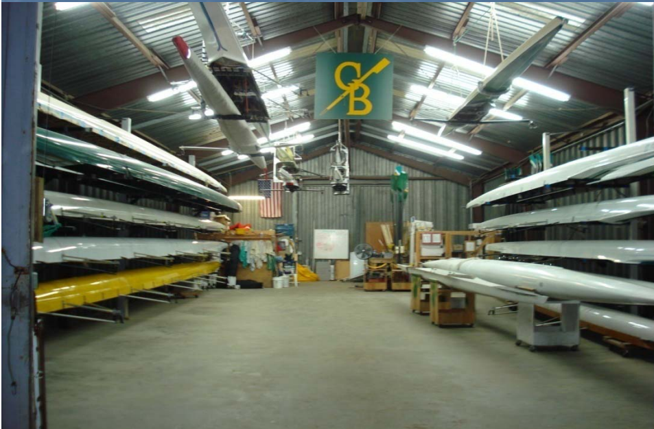
↑ HRC and GBC boats inside boathouse