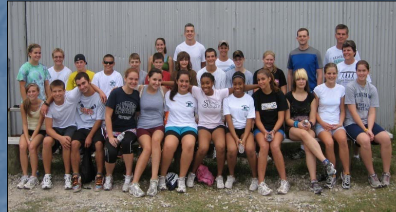
Hickory H.S. Rowing Club (HRC) Est. in 1998