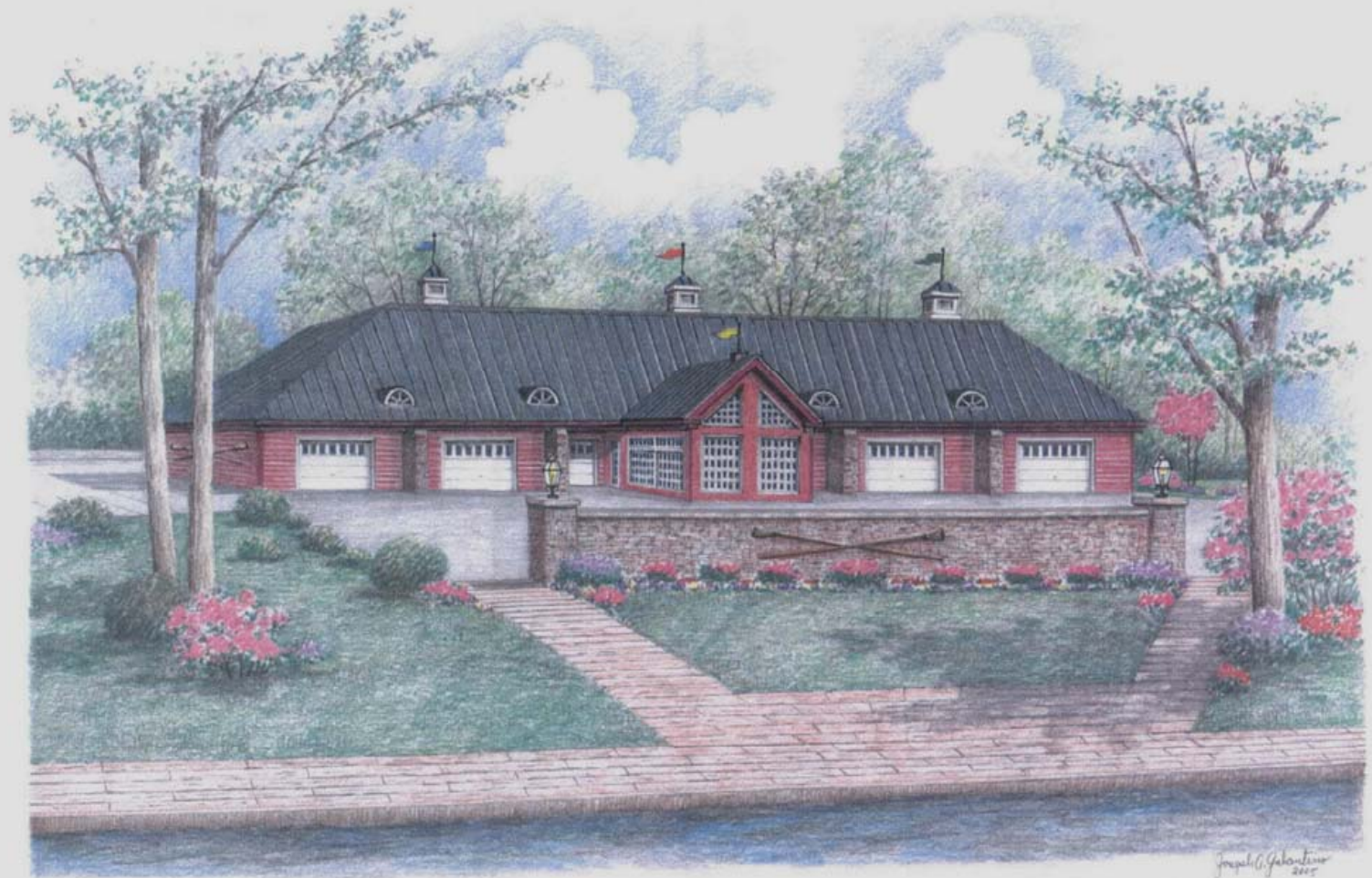
The Chesapeake Rowing Center